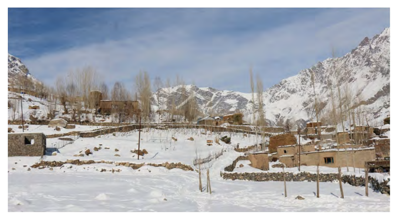
The Huf Valley.

As a result of the expedition 19 of the 126 ethnographical materials collected were handed over to the Grand Central Asian Museum in Tashkent. Andreev's research work culminated in "Tajiks of the Huf valley", a scientific monument that to this day has no parallel in the field of Pamirian ethnography.