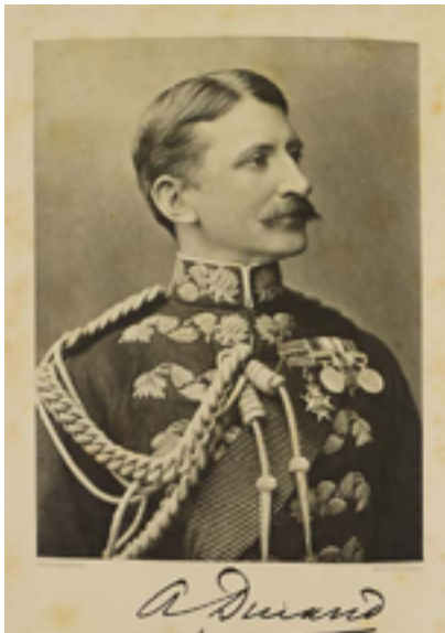
Frontispiece to The Making of a Frontier: Five Years' Experiences and Adventures in Gilgit, Hunza, Nagar, Chitral, and the Eastern Hindu-Kush (John Murray, 1899)

The main theatre of Anglo-Russian rivalry was in and close to the Pamirs: the present-day frontiers in the region were determined as a result of the agreements reached by Russia and Britain during this crucial period in their relations.