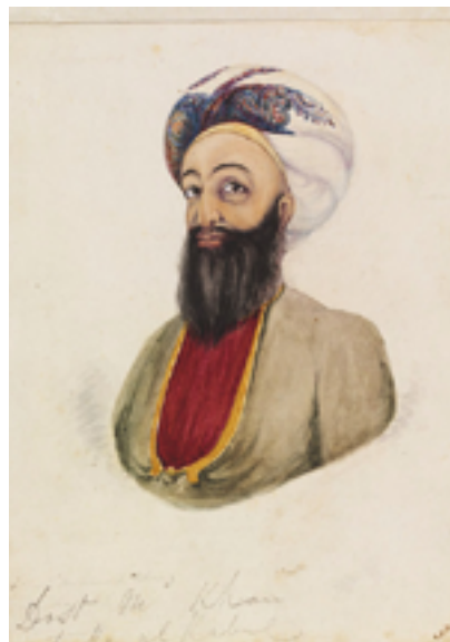
Dost Muhammad Khan, Amir of Afghanistan 1826-1839 and 1842-1863 (Godfrey Thomas Vigne 1801-1863 - Victoria & Albert Museum, London)

Lord Auckland was not wanting in judgment or sagacity, and his integrity of purpose is undoubted; but he lacked decision of character; he too often mistrusted his own opinions, and yielded his assent to those of irresponsible advisers less single-minded and sagacious than himself. The men by whom he was surrounded were among the ablest and most accomplished in the country; but it was for the most part a dangerous kind of cleverness that they possessed; there was too much presumption in it. These secretaries, especially the two younger ones, were too ardent and impulsive; they were of too bold and ambitious a nature to be regarded as anything better than perilous and delusive guides. But Lord Auckland entrusted himself to their guidance. Perhaps, he scarcely knew to what extent he was swayed by their counsels; but it is my deliberate conviction, that if he had not quitted Calcutta, or if he had been surrounded by older and more experienced advisers, he would have followed a line of policy more in accordance with his own feelings and opinions, and less destructive to the interests of the empire. 19