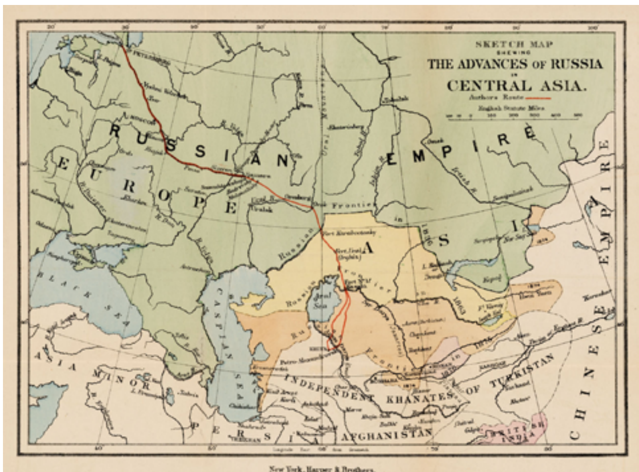
Fred Burnaby, A Ride to Khiva: Travels and Adventures in Central Asia. New York, Harper & Brothers, 1877.