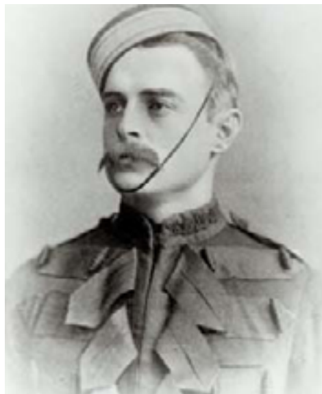
Francis Younghusband (1863-1942) (Younghusband 1887 from The Heart of a Continent , John Murray, 1937)

of the Afghan territory extend and how far those of the Chinese and Russians, so that I might be able to know about it, and with due knowledge, be able to send instructions to the Sarhaddar [governor] of Shighnan.” 70 Again, the question was whether the Amir’s territories included Shughnan and Rushan on the right bank of the Oxus, as well as Badakhshan on the left bank, and Wakhan.