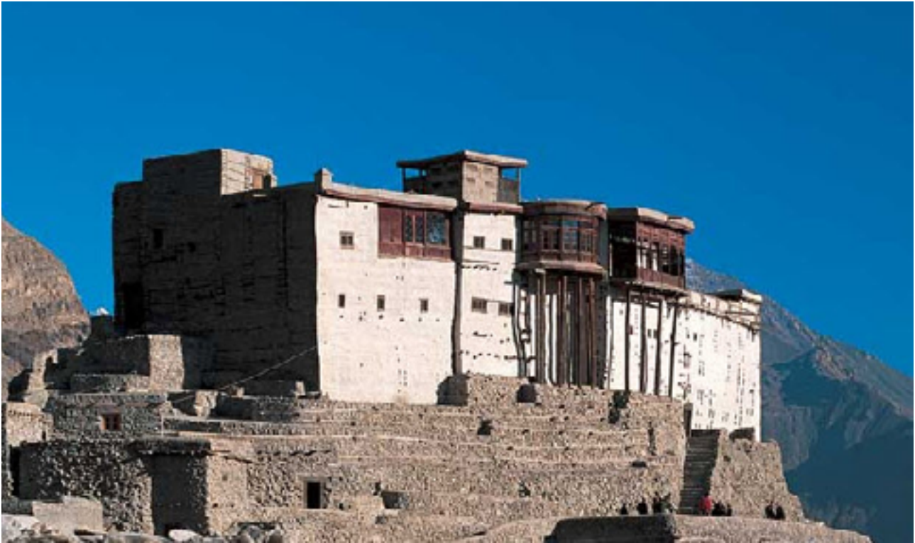
Baltit Fort, residence of the Mir of Hunza