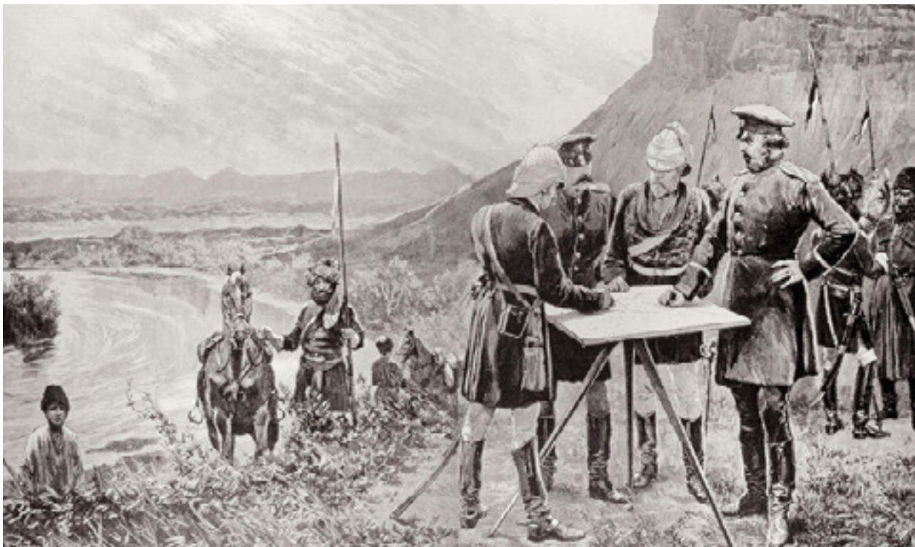
Russian and British Commissioners at Zulfikar, Fixing the Site of the First Boundary Post, 12th November 1885 Engraving from a drawing by Richard Caton Woodville, The Illustrated London News , 1st September 1886

A compromise was found that enabled the Russians to stay in Panjdeh while at the same time laying a solid base for the work of the boundary commission on the north-western frontier of Afghanistan, which commenced in November 1885, and, with the exception of the last few kilometres of the frontier up to the junction with the Oxus, was finished in nine months. The latter issue was finally settled in July 1887 by direct negotiations between the two governments.