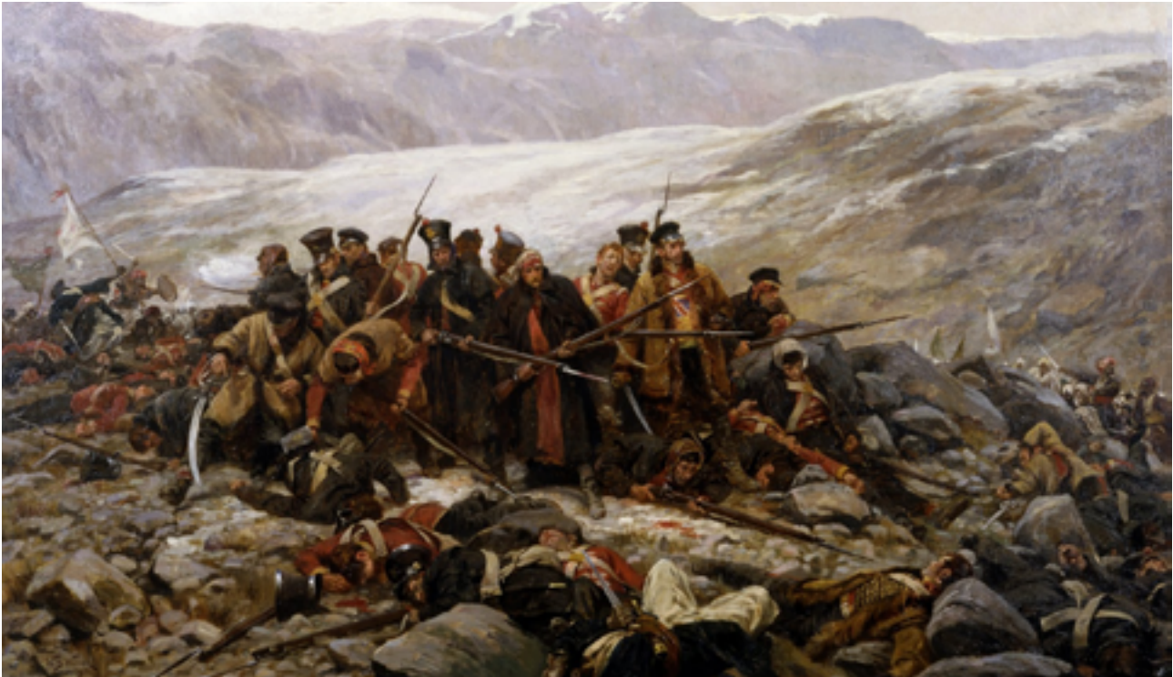
Last stand of Elphinstone's 44th Foot at Gandamak 1842 ( William Barnes Wollen 1898 - Essex Regiment Museum, Chelmsford)

returned as ruler. British policy was in tatters.