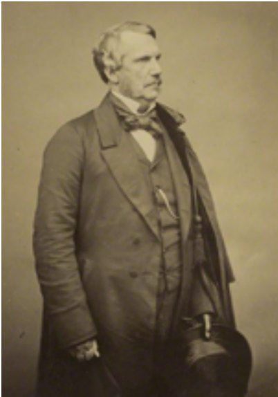
Sir John Lawrence, Viceroy 1864-69

ter”, pointing out that the distance from Samarkand to India via Bamian was about 900 miles, the number of men to be transported would certainly not be less than 30,000 and when and if they ever reached India, they would find a highly disciplined force under a British leader with good railway communications and fertile country in the rear 32 .