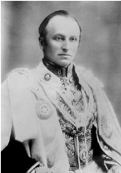
George Nathaniel Curzon, 1st Marquess Curzon of Kedleston (1859-1925) (ca. 1900;)

the daring of their adventures have tended to obscure the actions (often out of the public gaze) of their political and military masters at the centre of power, whose decisions determined the outcome of the Game.