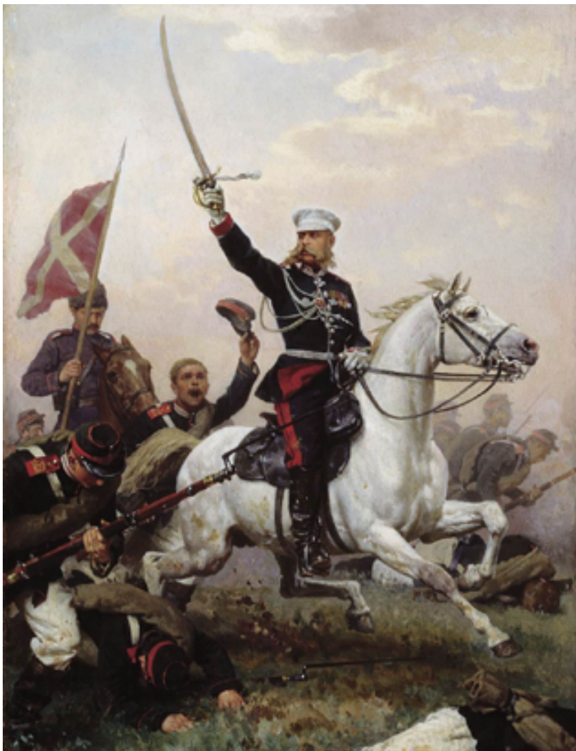
Mikhail Dmitriyevich Skobelev (1843-1882) - Nikolai Dmitrievich Dmitriev-Orenburg 1883

their hegemony in Central Asia. In 1878 the Turkomans repulsed an attack by a Russian force at Dangil Tepe and subsequently succeeded in regaining territory along the Amu Darya. Mikhail Dmitreyevich Skobelev, who was subsequently to play a major part in regaining Russia's footing in the region, wrote: