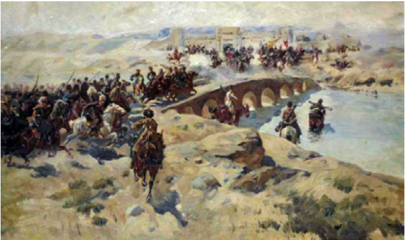
The clash at Kushka (Panjdeh) - Boï na Kyuuke - Franz Alekseyevich Roubaud 1893

recently established Afghan post in Panjdeh: the absence of an agreed frontier line made the legal situation ambiguous, but the Afghans threatened to take action, and sought British support.