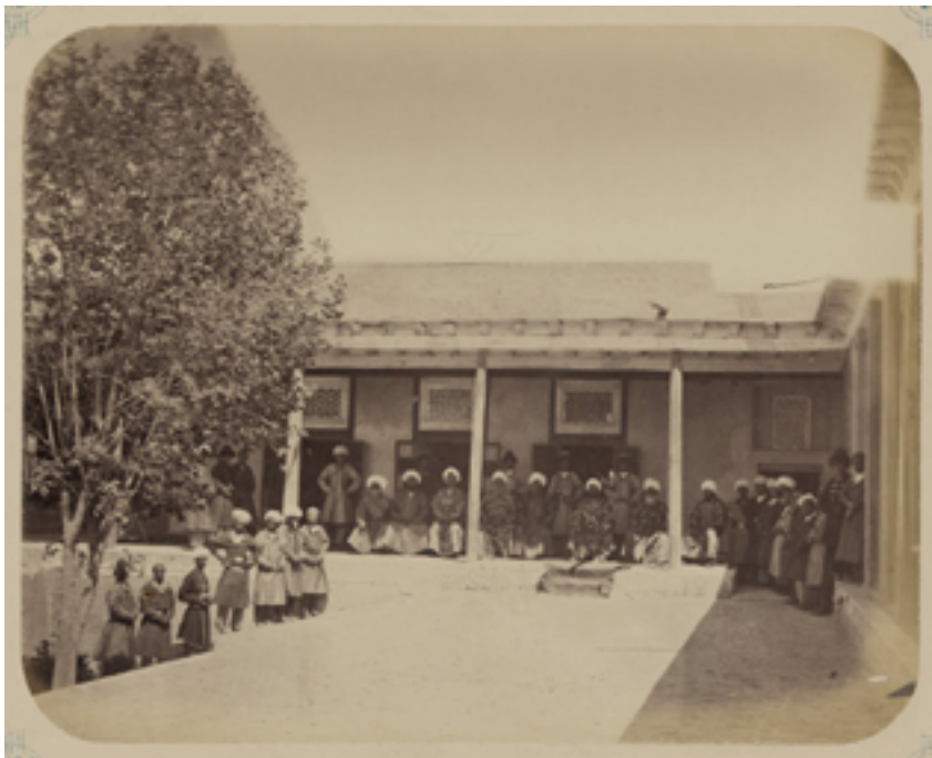
Kokand Khanate. Solemn Reception in the Khan's Court at Assak, ca 1865-72 104 www.wdl.org

movement could be made with the most telling effect if it was carried out in the early winter, when the nomads had moved, with their families, into their winter settlements, as they could then be more easily got at, and their escape would be rendered difficult, if not altogether impossible, on account of the deep snow with which the surrounding mountains would then be covered.