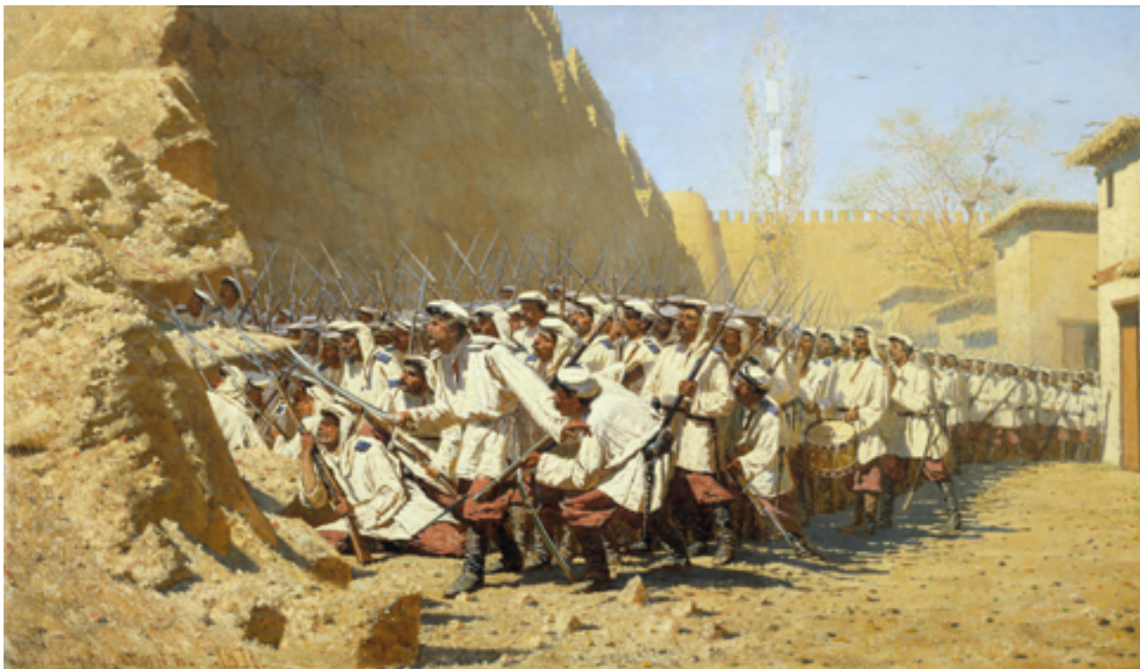
У крепостной стены. Пусть войдут! ("At the fortress wall. Let them in!" - Defence of Samarkand 2-8 June 1868) Vasily Vereshchagin 1871 (Tretyakov Gallery, Moscow)

In a famous 'Minute' written in 1867, the Viceroy, Sir John Lawrence, commented on the possibility that the Russians might occupy Afghanistan: