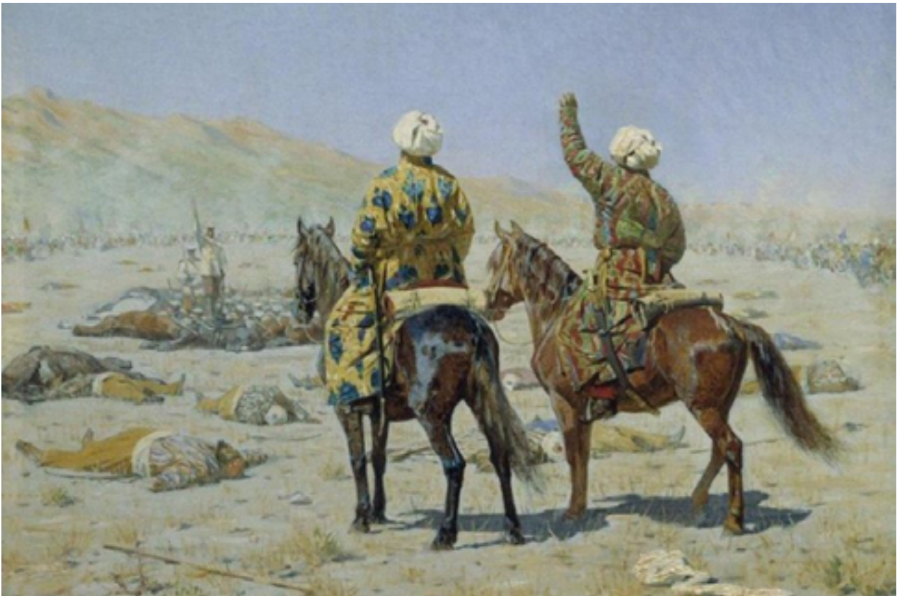
Negotiation - Vasily Vereschchagin 1873, Tretyakov Gallery, Moscow

wonder that we have never been trusted by the Afghan rulers, or liked by the Afghan people! In the history of most conquering races is found some spot that has invariably exposed their weakness like the joints in armour of steel. Afghanistan has long been the Achilles' heel of Great Britain in the East. Impregnable elsewhere, she has shown herself uniformly vulnerable here. 108