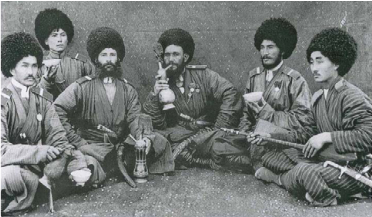
Detachment of Turkmen mounted militia 1896

China. Speaking entirely academically and unofficially, he thought that if Russia in twenty years' time adopted a forward policy it would not be in the direction of India but much further east. 79