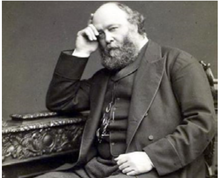
Robert Gascoyne-Cecil, 3rd Marquess of Salisbury 1830-1903

rounds, two storming columns advanced to the attack and soon penetrated to the centre of the town, where another battery was brought into action and continued the destruction of the place. By the next day all resistance had ceased: Andijan, which had inflicted such a serious reverse on Trotzky's column, was now subdued by the ever-victorious Skobelev; and the Russian troops occupied the remains of the sorely-punished city, Skobelev himself taking up his quarters in the Bek's palace, which Trotzky – in his anxiety to minimise his defeat – had reported to have been destroyed.