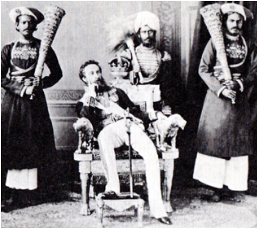
Lytton in Calcutta, 1877 (Mike Davis, Late Victorian Holocausts , Verso 2001, p.30)

The second offered itself when Stoletov went to Kabul carrying a draft treaty with Sher Ali in his pocket. But again the mission was promptly recalled by von Kaufman and although Stoletov did visit Kabul subsequently there were no offers of arms nor apparently any secret promises. 52