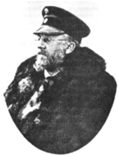
Nikolay Fyodorovich Petrovsky, 1837-1908

I perceive from the correspondence that the Indian government seems desirous to induce the Chinese and Afghans to meet north of Lake Victoria on the Alichur Pamir, and that it would appear that Captain Younghusband actually invited the Afghans to occupy Yashil Kul. Now, it appears to me that this would be a most dangerous policy to follow. It would be acting in flagrant disregard of the engagement of 1872-73; it would give a most legitimate “casus belli” to the Russians against Afghanistan, and we could not honourably encourage the Afghans to carry out such a plan unless we were ready to give them physical support. It seems to me absolutely necessary, if we are to enter upon these negotiations, that we should rigidly adhere to the binding character of the Agreement of 1872-73. 67