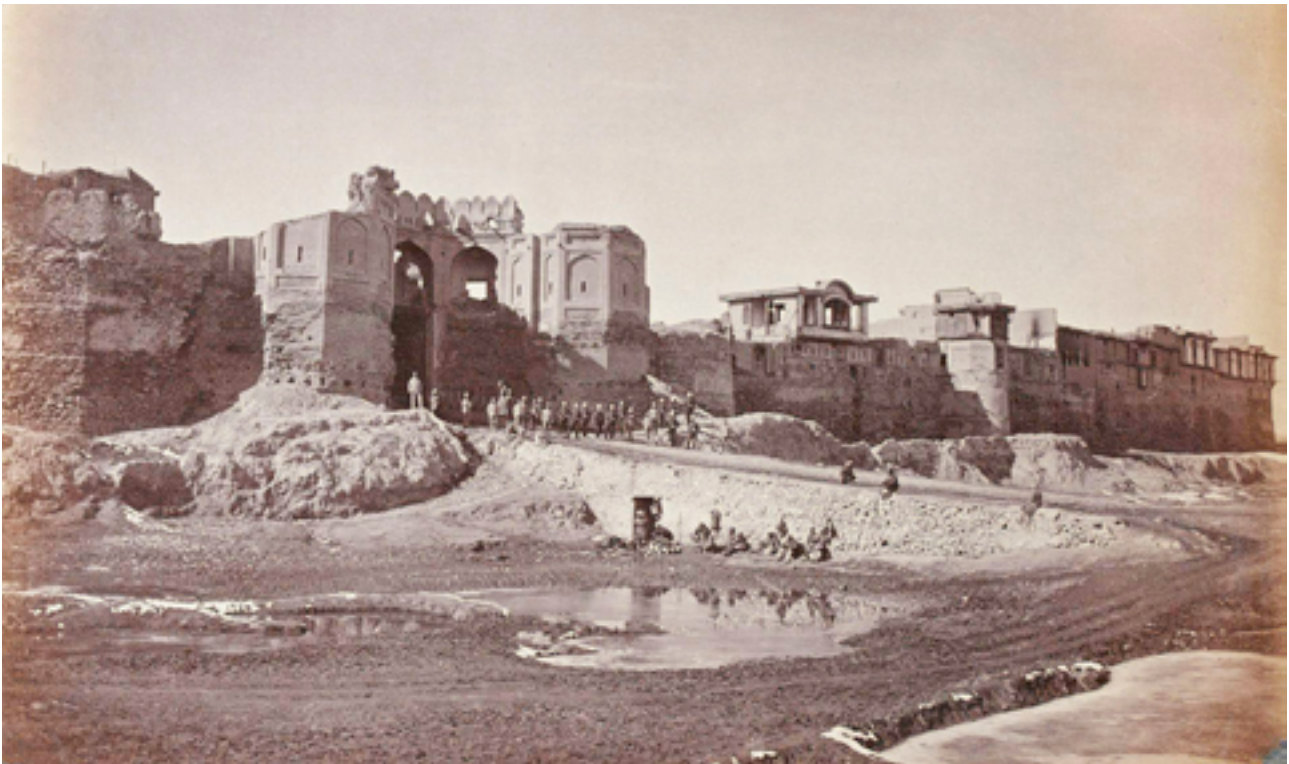
British troops at Bala Hissar fortress, Kabul 1879

The treaty involved the British in serious responsibilities for the sake of protecting the Indian Empire from imaginary attack, for no Indian or British authority – Lytton least of all – considered the danger of Russian invasion from that side a real one. If Russia had resources enough to undertake such an expedition, would she not have aided the Amir against English interference and won the sympathy of the Afghans by helping them in their hour of need? The facts indicate that Russia was not foolish enough to attack the strong Indian Empire from the side of the north-west frontier. All she wanted was to frighten the British in Asia by her diplomatic moves and thus lessen their grip in Europe. In this she was quite successful. 56