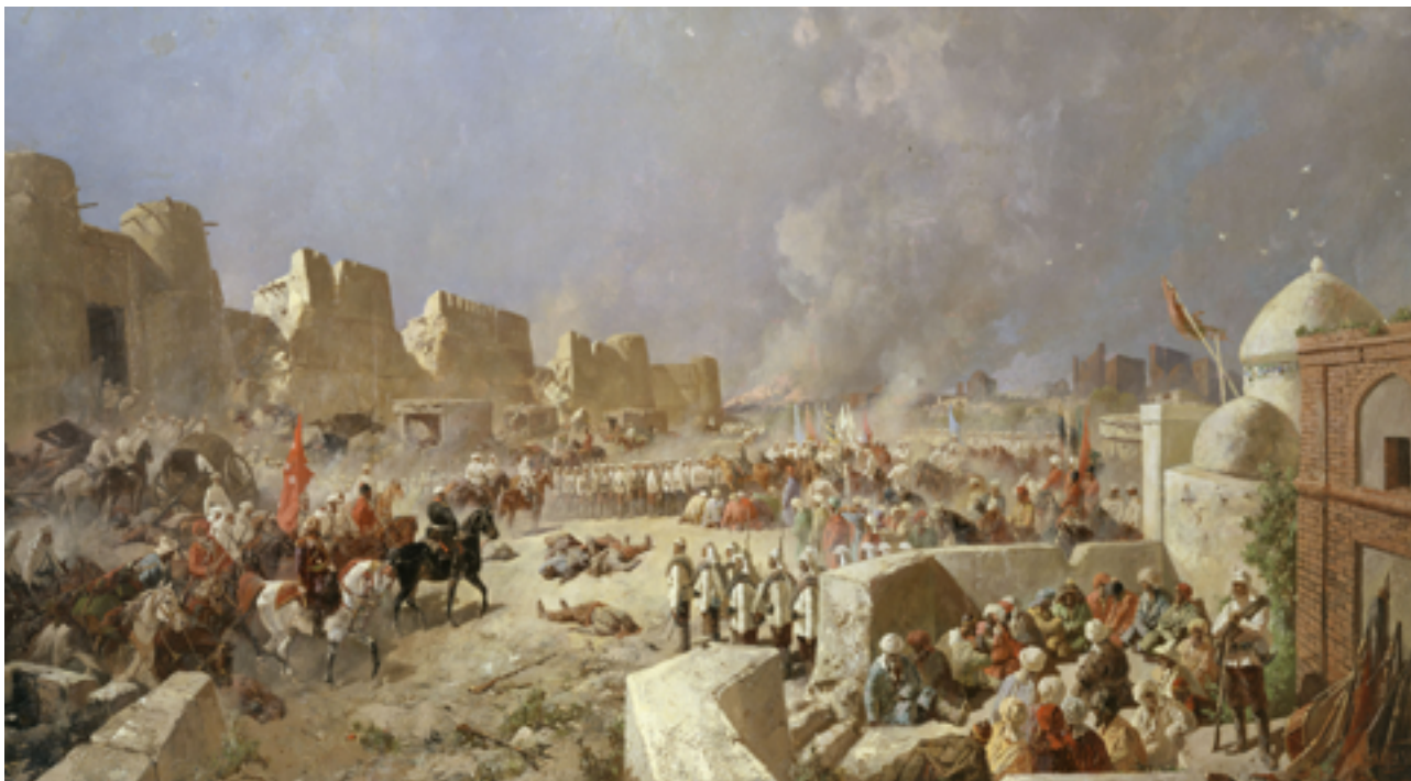
Nikolay Karazin, Russian troops taking Samarkand in 1868

In view of the independent action undertaken by Kaufman and others a few years earlier, it is significant that Russia here reaffirmed her recognition of the exclusive British sphere of influence in Afghanistan. At the same time, however, it was a warning to the British that the Russians did not interpret their obligations as requiring them to request British approval for direct relations with Afghanistan on non-political questions. The British, still distrustful of the intentions of both the Russians and the Amir, expressed displeasure at the proposal. The Russians did not force the issue and it was only settled to Russian satisfaction in the Anglo-Russian Convention of 1907.