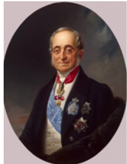
Count Karl Robert Nesselrode - 1780-1862 - Franz Kruger (Pavlovsk Palace Museum)

We stayed a short time at the top, looking out over the Badakshan mountains towards that mysterious Central Asia which attracts by the glamour of its past history, by the veil which shrouds its future. Balkh, Bokhara, Samarkhand, what visions come trooping as their names arise. The armies of Alexander, the hordes of Gengis Khan and Timur go glittering by; dynasties and civilisations rise and fall like the waves of the sea; peace and prosperity again and again go down under the iron hoof of the conqueror; for centuries past death and decay have ruled in the silent heart of Asia. 3