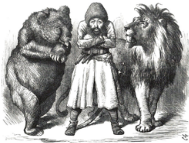
Sir John Tenniel (1820-1914) - Punch , 30.11.1878