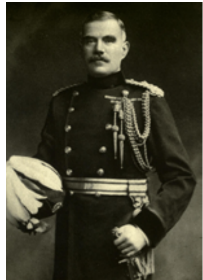
Sir William Robertson 1860-1933 ( Current History: The European War. Vol. 3 , The New York Times Company, 1915, p. 568)

the extension of Russian arms to the east of the Caspian has been of immense benefit to the country. The substitution, indeed, of Russian rule for that of the Kirghiz, Uzbeks and Turkomans throughout a large portion of Central Asia has been an unmixed blessing to humanity. The execrable slave trade, with its concomitant horrors, has been abolished, brigandage has been suppressed, and Mahomedan fanaticism and cruelty have been generally mitigated and controlled. Commerce at the same time has