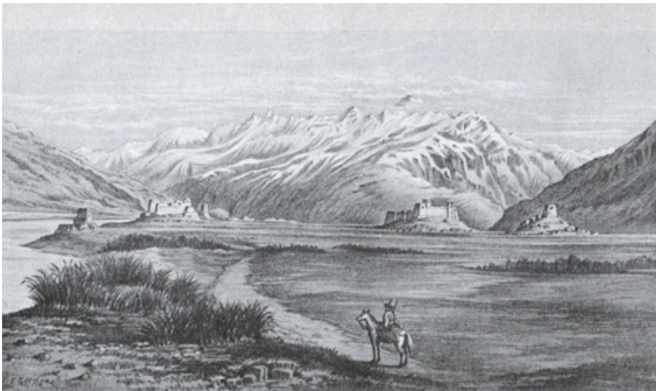
“Kila Panja on the Oxus looking East” 1874 (Thomas Edward Gordon, The Roof of the World , Edinburgh 1876, facing p. 132)