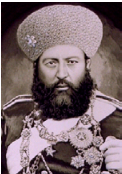
Abdur Rahman Khan, Amir of Afghanistan 1880-1901