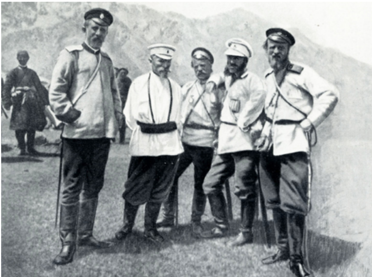
Russian officers at Pamirsky Post 1900 ( Wilhelm Filchner, Ein Ritt über den Pamir, Berlin, 1903 )