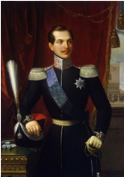
Alexander II - Natale Schiavoni 1838 ( Hermitage Museum )

British policy towards Afghanistan suffered from lack of consistency. While on the Russian side, General Kaufman was Governor-General of Turkestan from 1867 until his death in 1882, there were, during this period, no fewer than five Viceroys of India; similarly, while the Tsar exercised autocratic rule in Russia, the same period saw three changes of government in Britain. If Russophobia was generally a constant in Britain during this period, there were conflicting opinions about whether imperial interests would be best protected against supposed Russian ambitions by an Afghanistan that was: a) an independent and centralised state with institutions that could withstand encroachment (or blandishments) from Russia; b) a weak client state, totally dependent on external military support and subsidy; c) a buffer whose territorial integrity was best protected by agreement between (and in the mutually acknowledged interests of) the two main protagonists; or d) totally dismembered and permanently weakened. Lord George Nathaniel Curzon, future Viceroy of India, commented acerbically in 1889: