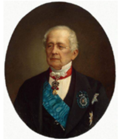
Prince Alexander Mikhailovich Gorchakov – Nikolai Timofeyevich Bogatsky 1873 (Hermitage Museum, St. Petersburg)

Bukhara, Kokand, and Khiva alike harassed Russian merchant caravans, looting the merchants’ goods and carrying Russian subjects away to slavery. The three principalities also purchased Russians who had been taken captive by Kazakh raiders, for the same purpose of enslavement. The death rate under harsh treatment and heavy labor was high, but the raiding of Russian caravans provided an easy way of replenishing the labor supply. The condition of the unfortunate slaves was long a matter of concern for St. Petersburg. 27