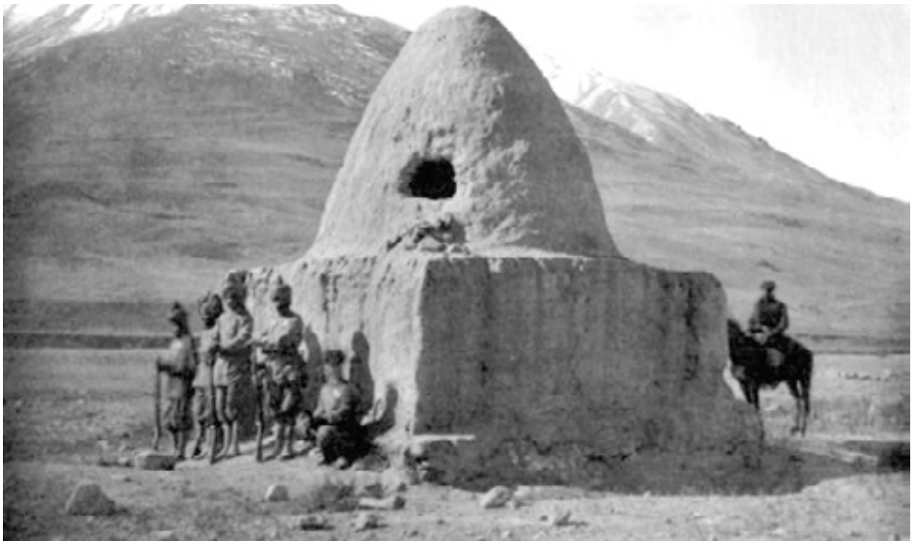
Boza-i-Gumbez, with Punjab infantry, 1895. Report on the proceedings of the Pamir Boundary Commission , Calcutta 1897, betw. pp. 46-47