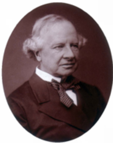
Granville Leveson-Gower, 2nd Earl Granville, Foreign Minister 1851-52, 1870-74 and 1880-85 www.wikipedia.org

It was unfortunate that the British were not ready at this time to enter into a treaty with the Russians confirming this understanding – which was in essence the definitive frontier agreed just over twenty years later, including the notion of a neutral buffer zone (the Wakhan). Had they done so, a source of future tension might have been removed and the second Afghan war avoided.