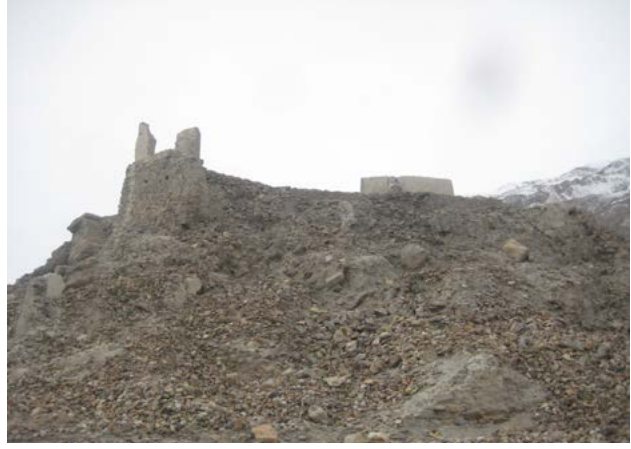
A panoramic view of Qal'a-yi Panja – the former capital of the Wakhan principality (left) and the ruins of an old fortress (right). The picture was taken in January 2012.