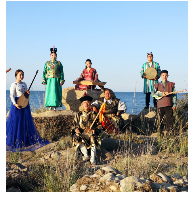
Participants of the musical performance "The Sky Reflects Within Us"

Central Administration Office 125/1 Toktogul Street, Bishkek, 720001, Kyrgyz Republic