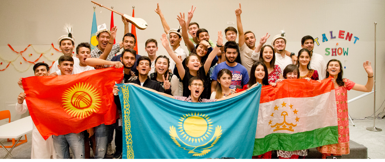
UCA undergraduate students

promote cultural creativity, bio-cultural diversity, and eco-cultural tourism in the region. It presents cultural heritage to modern audiences in formats including creative texts, photo essays, films, animation, fashion, as well as theatrical and musical productions.