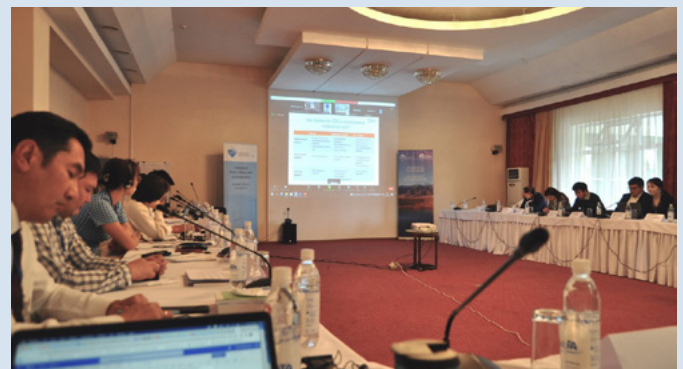
Participants from Central Asia and Mongolia discuss the importance of considering environmental issues in development planning.