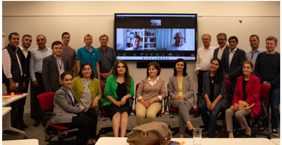
Participants of the seminar.

The initiative was undertaken within the framework of the SAS research cluster "Modernity in Central Asia: Identity, Society, Environment". The seminar brought together local and international researchers to explore various aspects of history, environment, and development in the context of the mountainous regions, particularly the Pamirs.