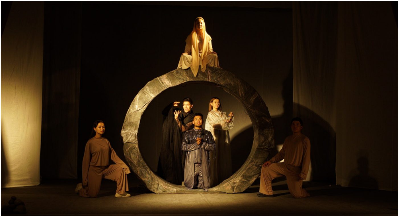
A performance of Mother Earth (Jer Ene) by Youth Experimental Theater "ART Jashoo".

For four days, Naryn, Kyrgyzstan, was the focal point of an International Conference exploring contemporary and traditional image making practices through the transdisciplinary lens of art, sciences, and culture. From September 22-25, the Nomadic Image Conference attracted artists and international personalities who contributed to this unique cultural extravaganza making it a resounding success.