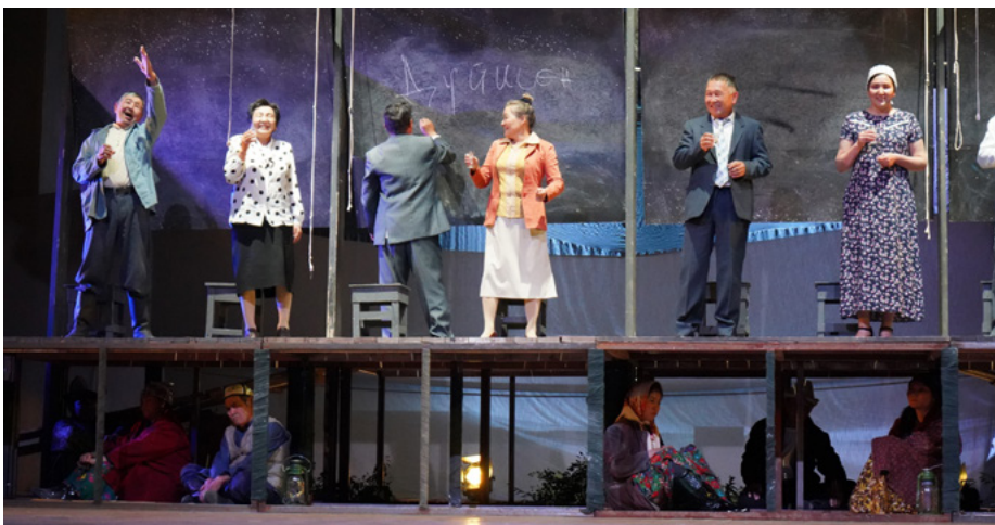
The performance of Chyngyz Aitmatov's "The First Teacher" in the Naryn Regional Academic Musical Drama Theater.