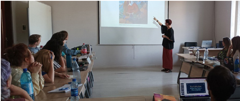
Participants at a lecture on the cultural heritage of Central Asia

In September 2022, Aga Khan Humanities Project (AKHP) conducted a three-week international summer school 'Past, Present, Future? Critical Approaches to Cultural Heritage in Central Asia' in Dushanbe, Tajikistan. The school attracted 19 young people from Germany, Tajikistan, Canada, and the United States, to improve their knowledge of Central Asian history, cultures, and languages.